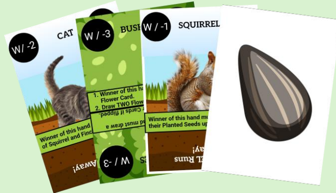
9 Wild Cards 3 Cats | 3 Bushes | 3 Squirrels