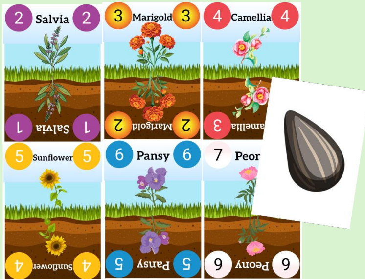
6 Flower Suits (Salvia, Marigold, Camellia, Sunflower, Pansy, and Peony) Each suit numbered 1-12 | 72 Flower Cards in total